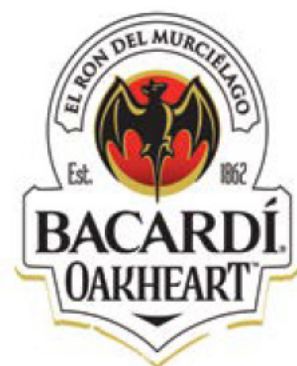
Artwork NOT Embedded